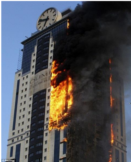
Figure 1: April 3, 2013 - Gronzy-City Towers, Chechnya

This article addresses the disturbing movement in the U.S. towards trading off exterior wall assembly fire performance safety requirements in the building code when internal sprinklers are present in buildings. This has occurred in certain areas of the country and a similar code change was attempted in April 2015 during the 2018 International Building Code development hearings.