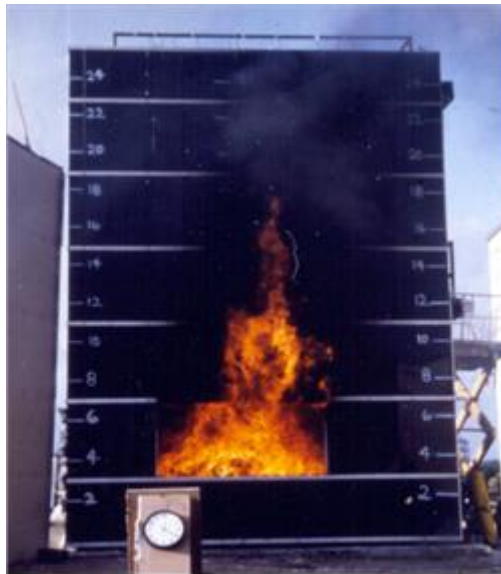
Figure 1: SPI wall fire propagation test

An ignition source needed to be standardized. As is common in reaction-to-fire testing, an ignition source was chosen that would be capable of causing some initial ignition, and that the ensuing fire behavior would be dependent on the tested material itself. Bounding the ignition source at the upper end, the ignition source should be within the order of magnitude of some true-to-life fire ignition. The ignition source chosen was an extension of flaming out of a lower floor fire compartment “window”. This would simulate a possible flashover fire in the lower floor. Such a fire might not occur in each and every fire incident in a multi-story building. However, even with automatic sprinkler protection provided throughout the inside of a building, a flashover fire is a real and known possibility, for example in the case of a fire with the sprinkler protection water supply impaired or shut off. According to data from the NFPA 1 , automatic fire sprinklers operated effectively in 87% of all reported fires where sprinklers were present in the fire area and fire was large enough to activate them. Most of the recorded sprinkler performance failures were due to water supply impairments, such as a shut sprinkler control valve. So an exterior wall ignition scenario wherein fire sprinklers do not control a fire should definitely be considered credible and realistic.