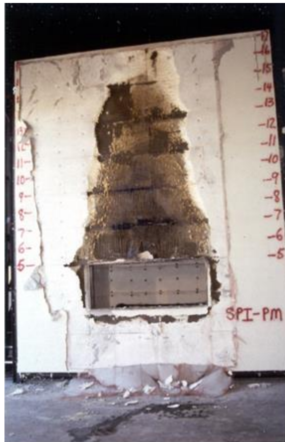
Figure 1: Post-test damage to foam plastic insulated wall

testing was not required". Note that complete details are not offered for each incident, as the countries in which these incidents occurred for the most part do not have an open system of public fire investigation and reporting. Facts that seem to have been verified by local news media or local technical experts are reported below. The incidents are presented in chronological order, starting with the most recent.