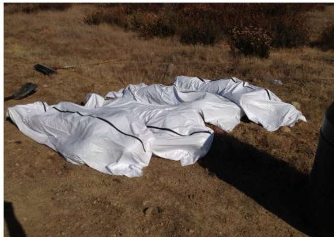
Picture 8. Mannequins used to simulate victims