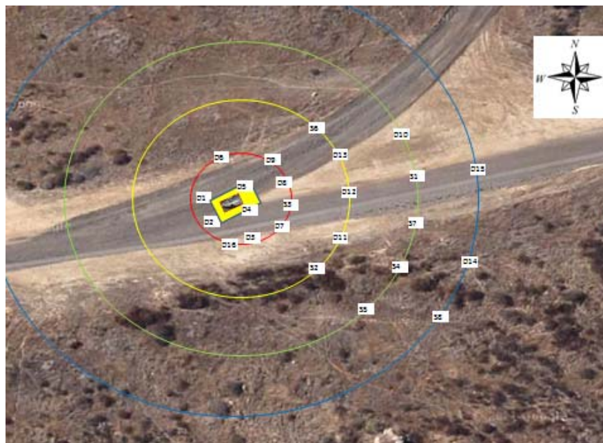
Picture 4. MSA Safesite Detector Setup

During all tests, the outside of the vehicle was monitored for hydrogen sulfide gas leaking from the door cracks. The MSA Safesite ® detectors were setup around the car, downwind up to 100'.