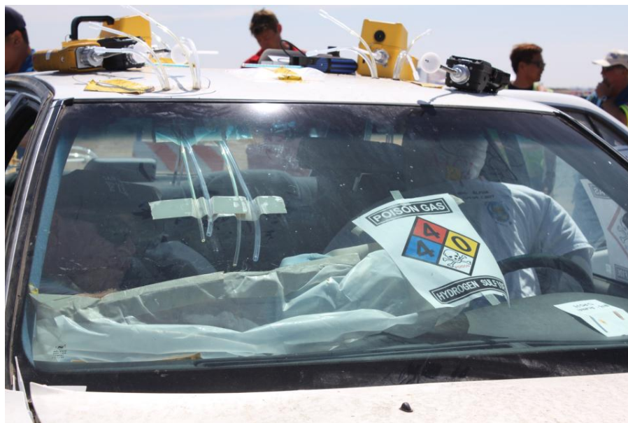
Picture 2. Sedan with tubing plumbed into the breathing zones at all seats.

In this study we used a vehicle to simulate a real event. We were able to obtain a 1981 Nissan Maxima sedan from a local towing company. The vehicle was plumbed with tubing for real-time monitoring during the tests that were to be conducted.