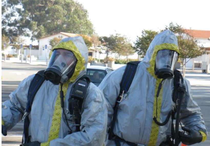
Picture 7. Level “B” ensemble for neutralizing the remaining solution.

8. Is the remaining chemical mixture still a hazard to first responders?