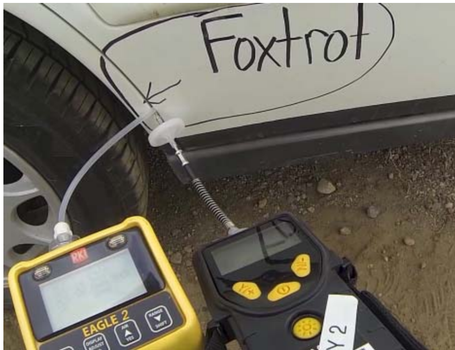
Picture 5. RKI Eagle2 combustibles gas indicator on the left and the RAE 3000 photo ionization detector (PID) on the right.

7. What is the best personal protective equipment to utilize for a detergent suicide incident?