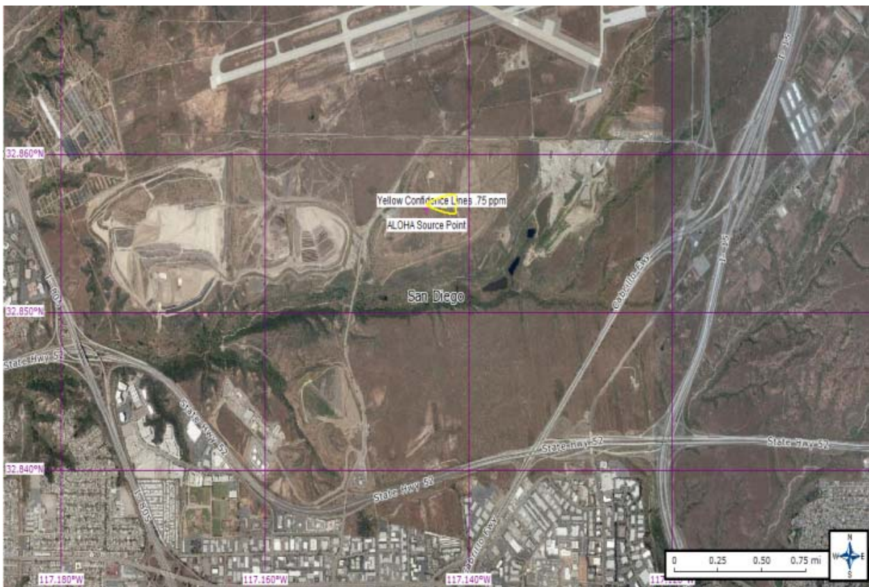
Picture 1. The yellow outline represents 305 yards from the point source. At this border you can be at safe exposure levels of hydrogen sulfide gas. There was ample room at this location to conduct the study.

In this study we used a vehicle to simulate a real event. We were able to obtain a 1981 Nissan Maxima sedan from a local towing company. The vehicle was plumbed with tubing for real-time monitoring during the tests that were to be conducted.