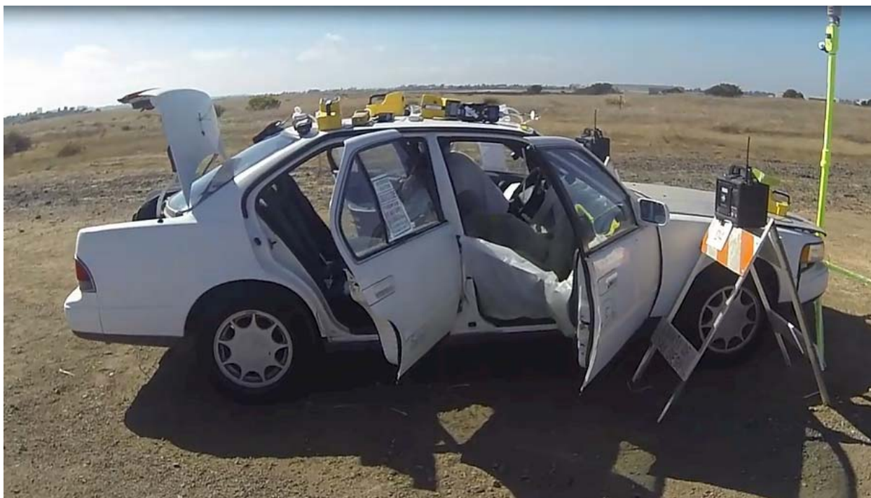
Picture 3. Photo of the vehicle with all of the instrumentation plumbed into the car and the MSA Safesite on a barricade. The weather station is at the front of the car on a yellow tripod.