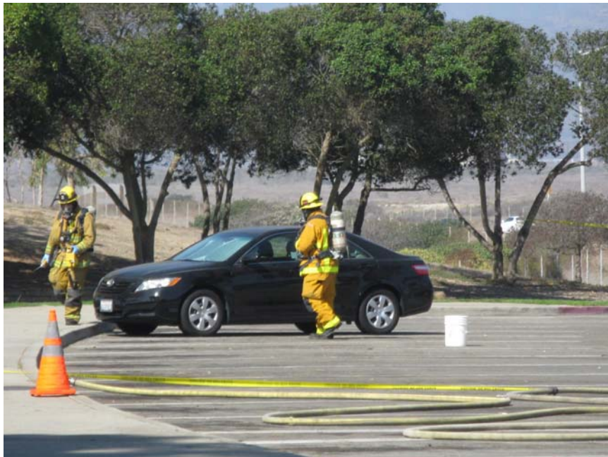
Picture 6. Entry team in fire fighter turnouts conducting reconnaissance at a real incident