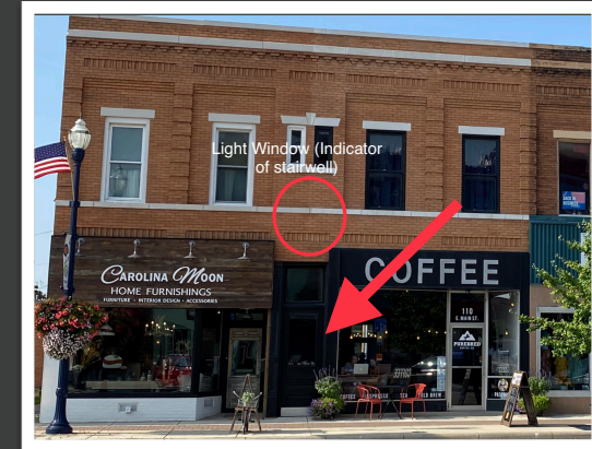
Light Window (Indicator of stair well)