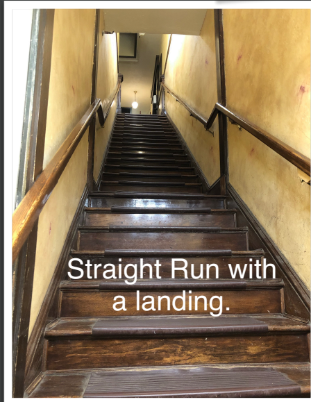
Straight Run with a landing.